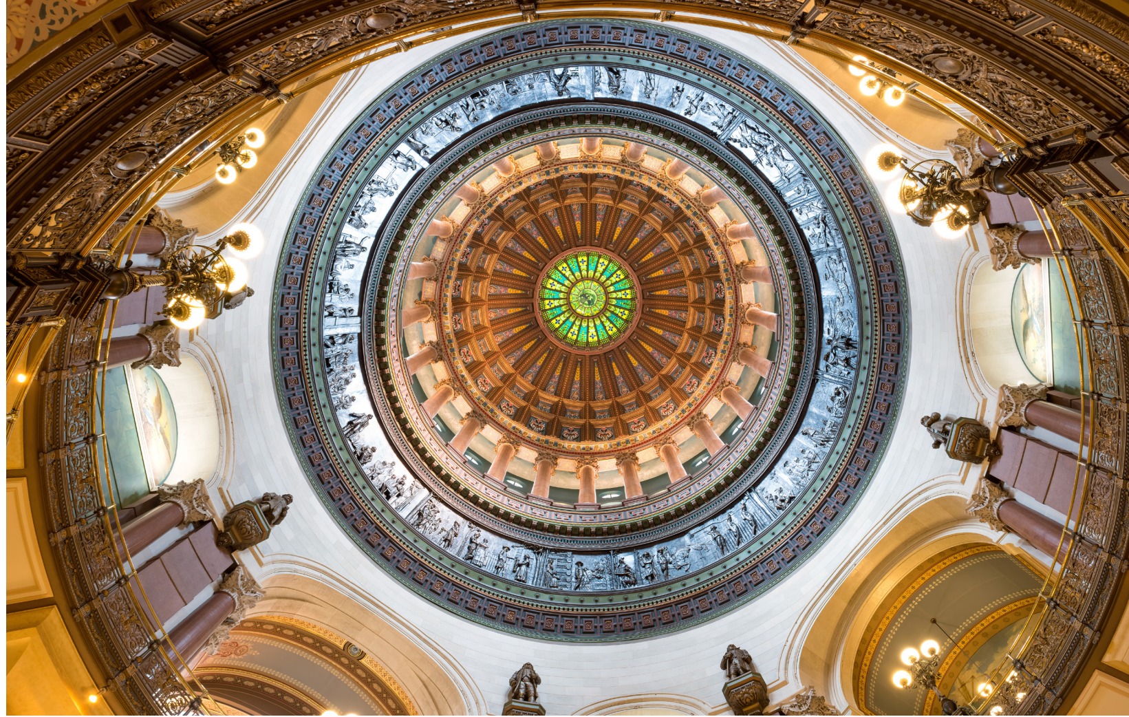
PREFACE TO LAWMAKING, 104TH GENERAL ASSEMBLY